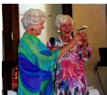
The Emma Darcy Award Winners and The Speakers Award